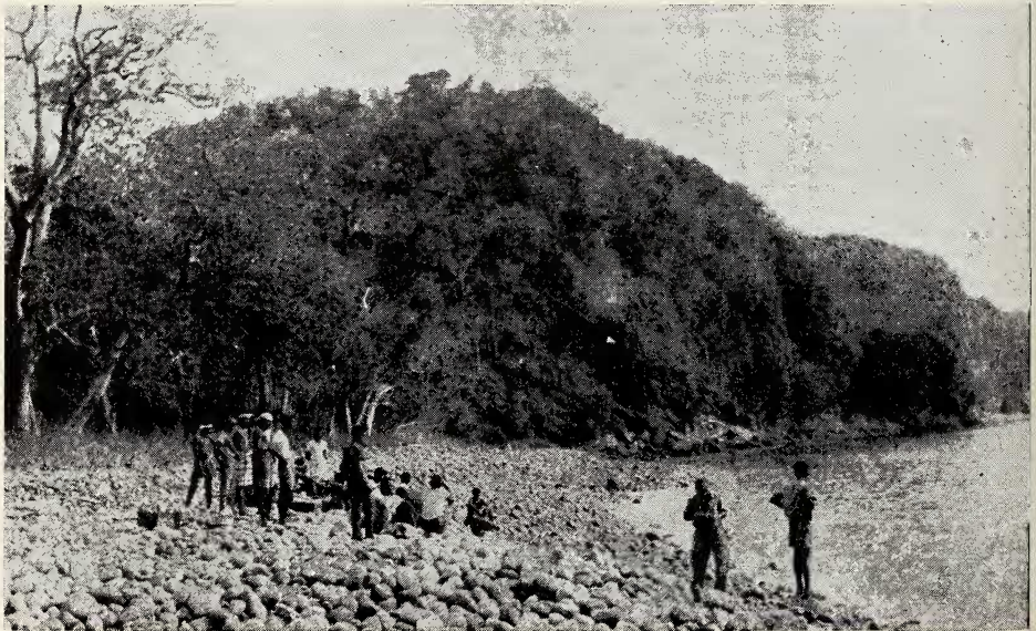
Above: Barren Island with volcano.